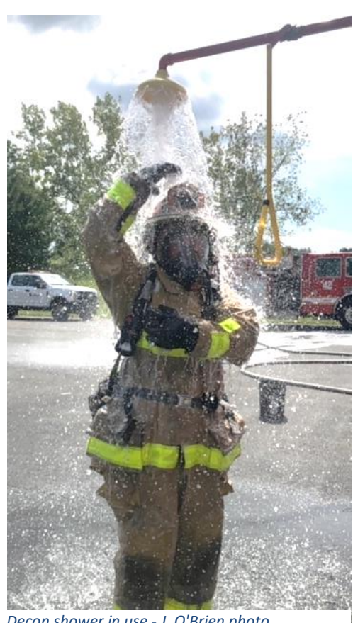
Decon shower in use

Financially, we did OK even though our vehicle maintenance costs were way up. We were able to add some reserve to our Apparatus Replacement Fund. Someday, in the future,