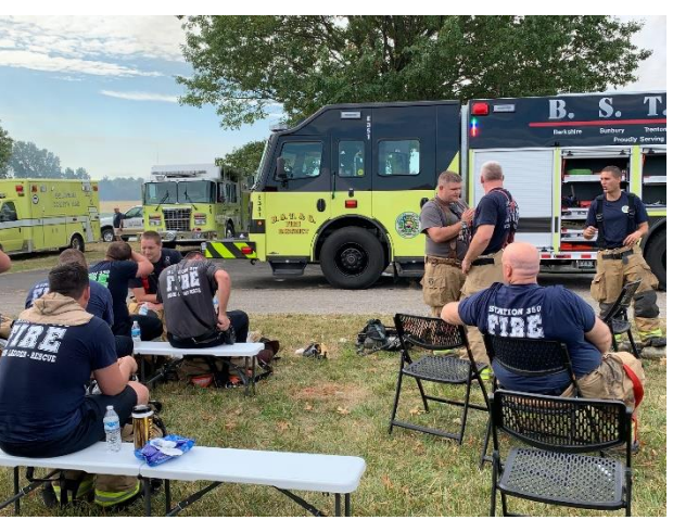
Rehab at BST&G burn