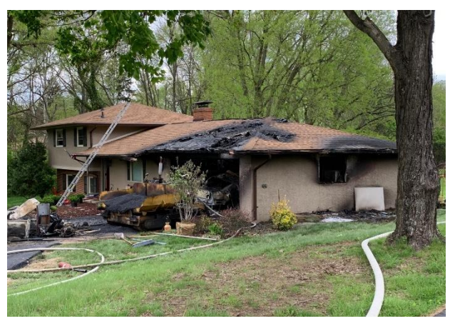
Darbyshire house fire

While we've been distributing pre-moistened wipes for several years to help firefighters clean exposed skin, this month we stepped up that process by creating "First In, First Out" decontamination kits. These kits contain the wipes, soap and brushes for cleaning PPE, particle masks, nitrile gloves, disposable gear bags, and tags. Along with our shower unit on Rehab 2, we can perform "gross decontamination" in the field when requested. Protocols for this are still being developed by the fire departments that we serve, but we're ready when they are.