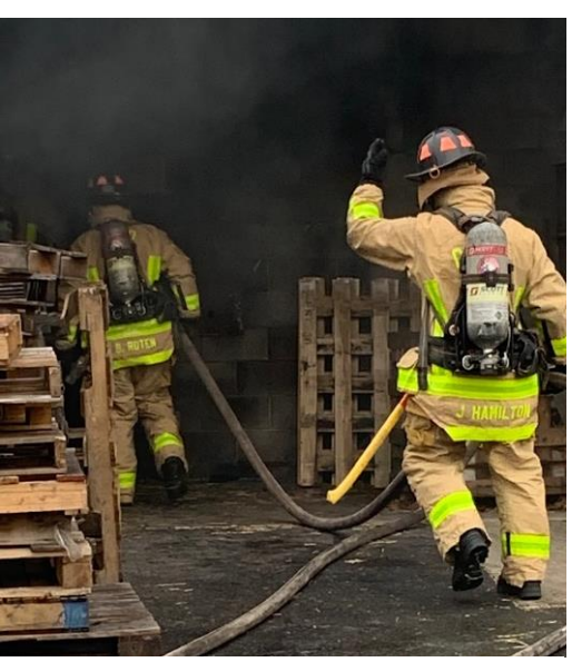
Div. Ops. burn at OFA