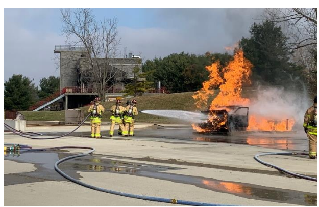
LP & Auto fires at OFA