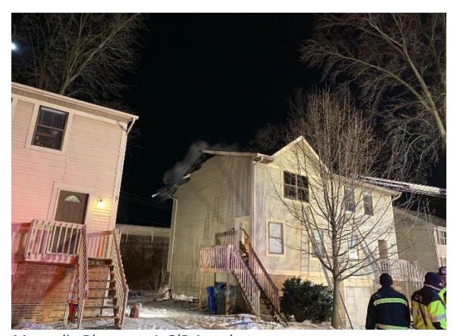
Magnolia Blossom

Rehab 2 came back from extensive repairs shortly after the first of the year. It had been in the shop since November. It was good to get it back in service because January turned out to be pretty busy. Repairs wound up costing $13,000 but, thanks to the generosity of the Columbus Firefighters Foundation, Genoa Township Firefighters and several others – including a Facebook appeal by a Columbus firefighter (and great friend), donations covered a little more than half of the bill. We made it to the middle of the month before our first major fire ( a 2-alarm apartment fire), however we did have several