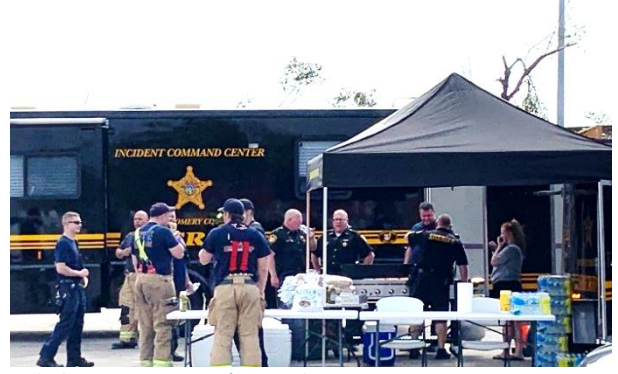
Rehab at Dayton