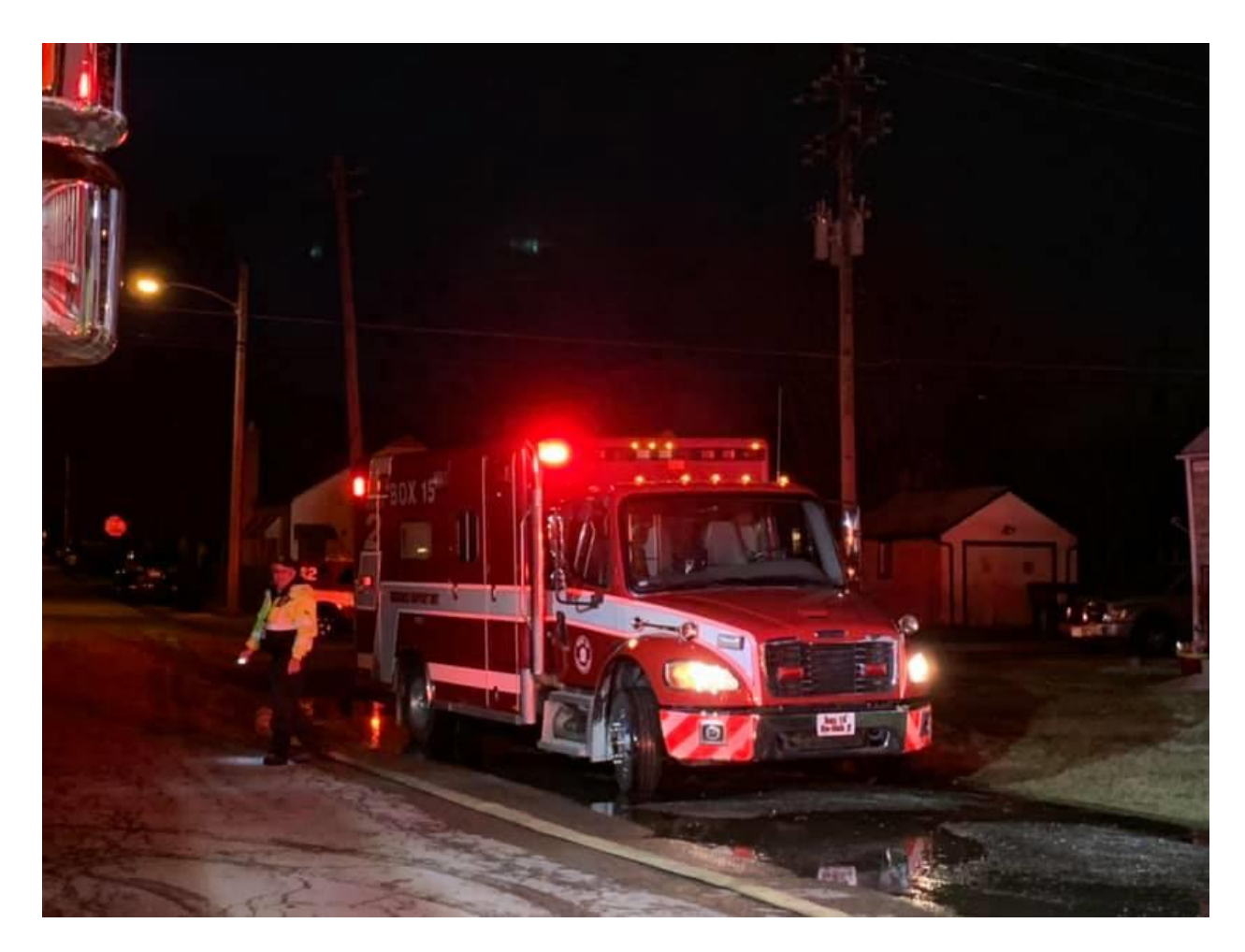
Rehab 2 in Reynoldsburg