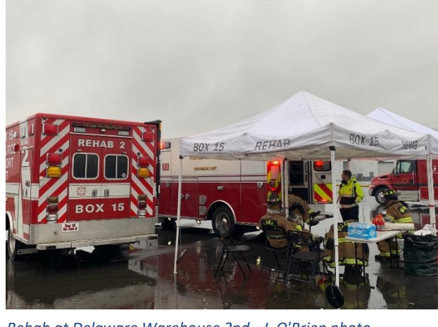
Rehab at Delaware Warehouse 2nd