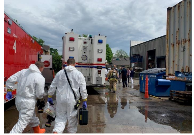
Westerville Rd. Hazmat

had two second alarm fires and four working fires, an extended deployment due to an overturned tanker truck/hazmat incident, three more days working with Red Cross, Westerville and Worthington firefighters for another smoke alarm distribution and a very unique heavy rescue incident. We closed out the month by responding to Dayton with the Central Ohio Strike Team because of a major outbreak of tornadoes. Sandwiched into this, one of our members participated in several days of training on the new Strokemobile, put in service jointly by Columbus