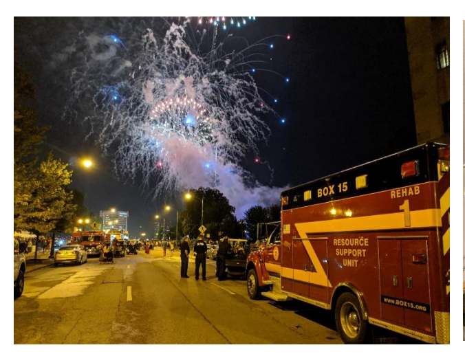
Rehab 1 at Red, White & Boom

The family also made a sizeable donation and with those donated funds, we were able to install powered awnings on both Rehab 1 and 2.