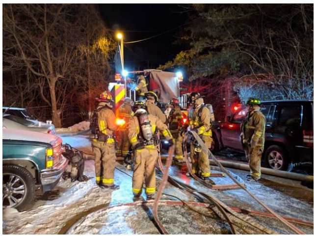
Loading hose on Sunbury Rd.