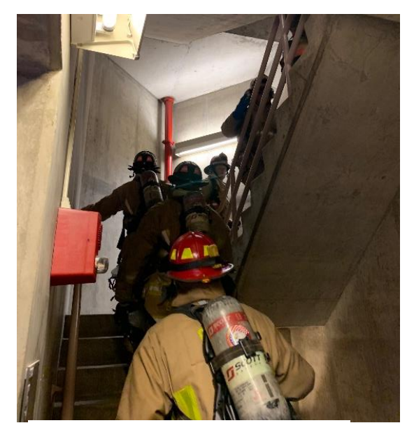
9/11 Climb - B. Barber photo