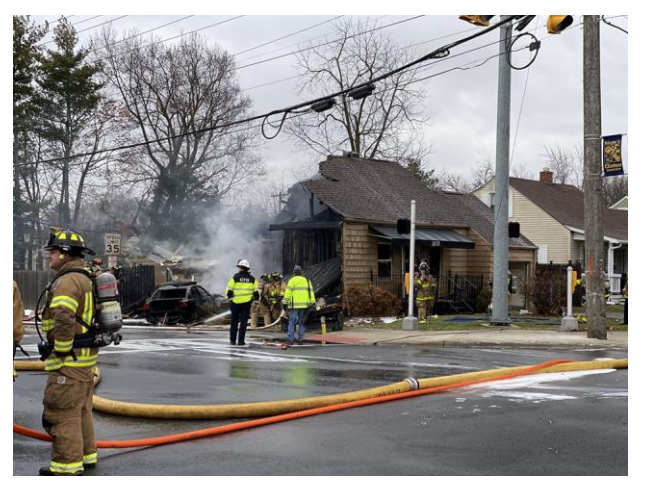
Kenny Rd. auto vs. house