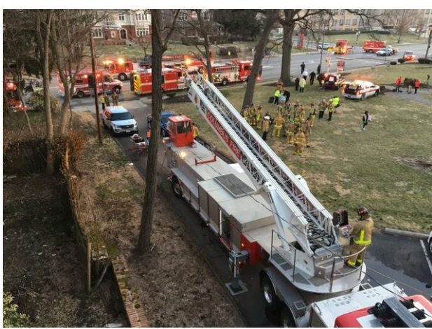
1445 E. Broad St. CFD Aux photo