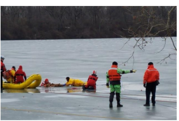
Ice Rescue Training