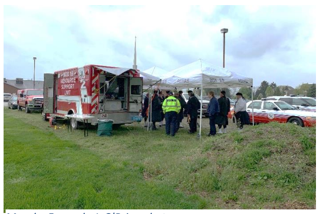
Murphy Funeral

In April, we had three second alarm fires within a two-week span. We also suffered another firefighter PTSD loss – this one an Orange Township man that we had known from his Columbus Fire Auxiliary days. We were once again honored to provide a variety of support services during visiting hours as well as at the cemetery, which was a wet, windy, raw day. Near the end of the month, we partnered with Red Cross and Whitehall Fire to do a smoke alarm installation and education program. During our annual Spring Apparel Sale, we took the