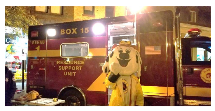
RSU-1 at 1st Friday Delaware

October, because of Fire Prevention Week, is typically when public safety awareness programs peak and 2019 was no different. We attempt to participate in as many of these activities as possible, however staffing does limit us because many of the fire station "open houses" occur simultaneously. We only had three fires during the month. One of those was during a hot weather standby, when the temperature sat at 94 degrees and while were working the Prairie Twp. Open house, we had to pack up and leave in order to take in the Grove City fire, which involved a historic barn as well as two garages.