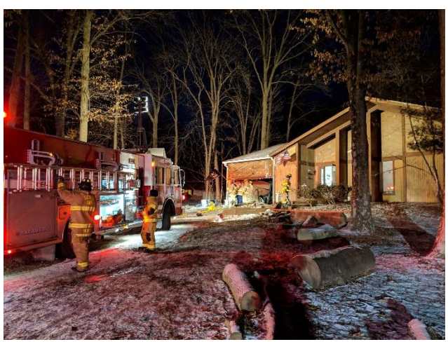
Red Bank Rd. fire