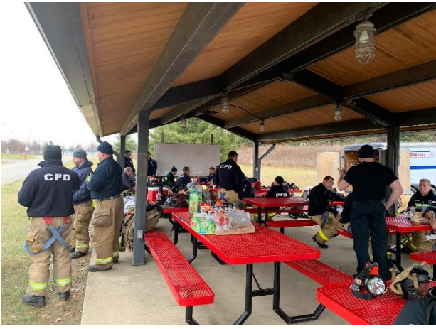
Rehab at Ohio Fire Academy