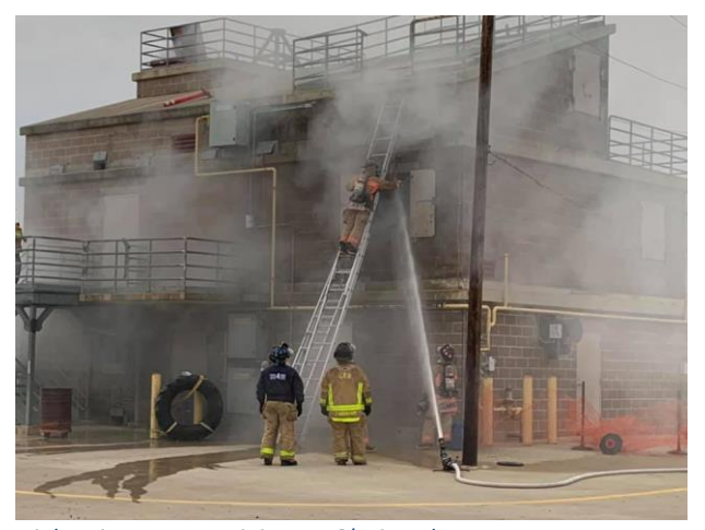
High Point rescue training