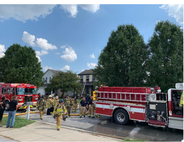
Radbourne Dr. house fire