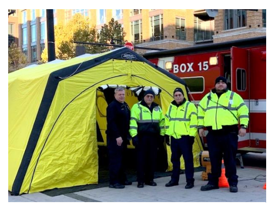
Vets Day Parade