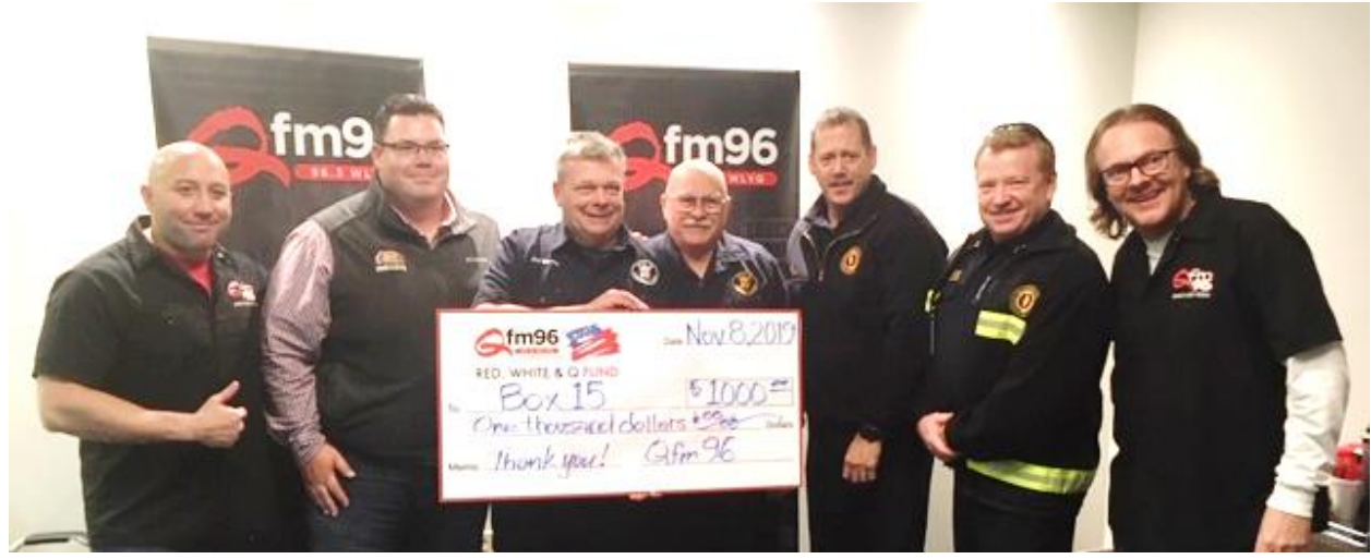
QFM96 & Raising Cane's Donation

Our primary source of funding is still the sales of apparel – tee & sweat shirts, shorts, sweat pants, hats and, most recently added – hoodies. In addition, being a 501(c)(3) not-for-profit corporation, we have been blessed with a number of significant donations – both financial as well as equipment, services and consumable products. We should note that this was our best year ever for donations. Combined, these have strengthened our financial position and even allowed us to add a modest sum to our Apparatus Fund.