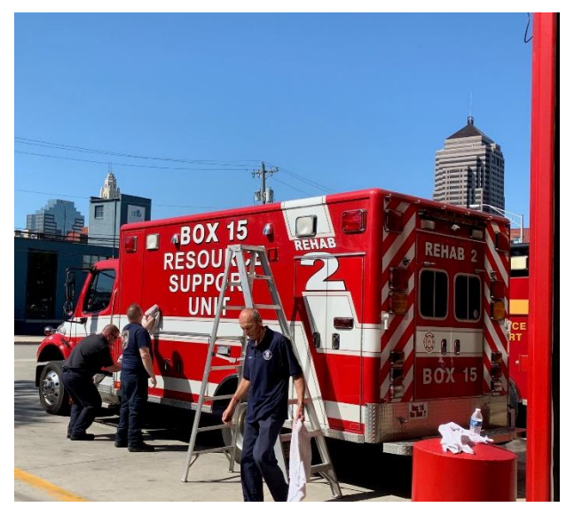
RSU-2 bath time

August brought us the only third alarm fire. MillTech, a custom cabinet manufacturer went up in a spectacular blaze on the 16<sup>th</sup> and Box 15 was on the scene for several hours. We also had a working fire and two seconds during the month. A few days prior to the MillTech fire, we were requested for support by the Columbus Humane Society when they rescued more than 250 animals from a puppy mill in Grove City. This was our first time ever assisting at an activity of this kind. August also had us working at three days of recruit training and participating at three public safety education events.