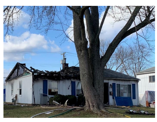
Meadowbrook Dr. house fire