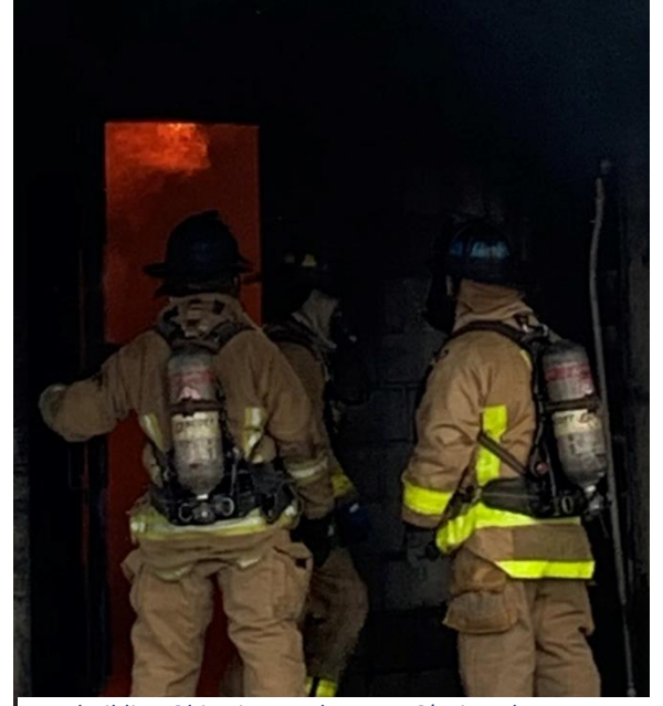
Burn building Ohio Fire Academy