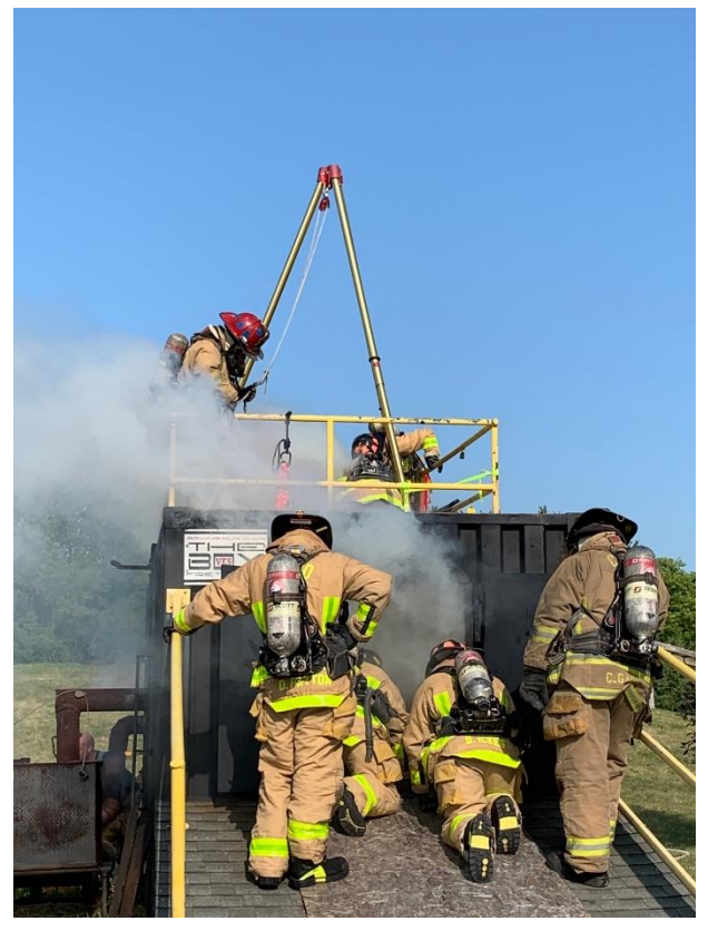
Vent/Entry/Search Training