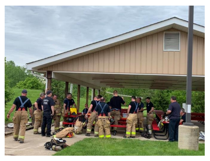
Rehab at CFD TA