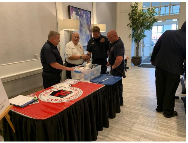
Ohio Fire Chief's Conference