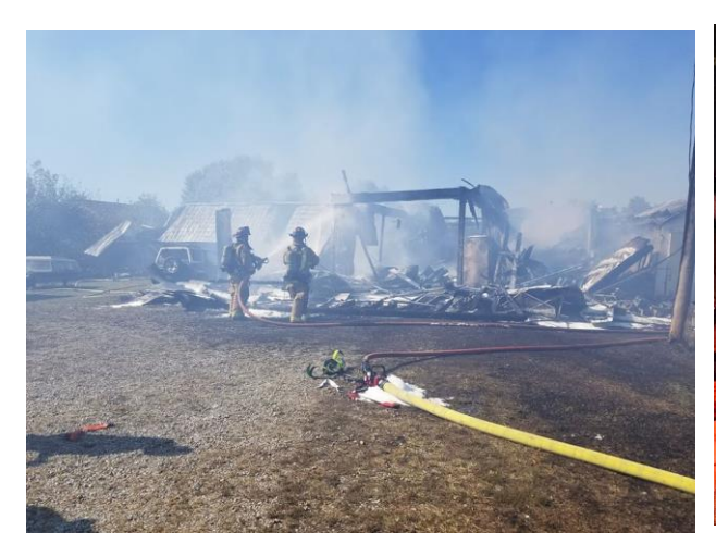
Demorest Rd. Barn Fire