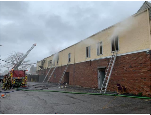
E. Bublin-Granville 2nd