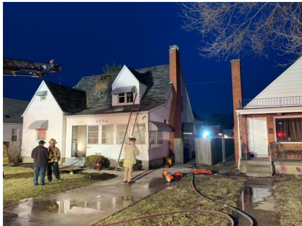
Hyatts Rd fire