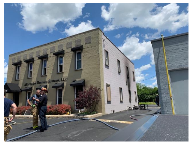
Indianola Ave. 2nd Alarm