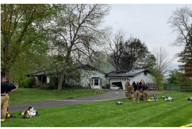
Old Hall Rd. house fire