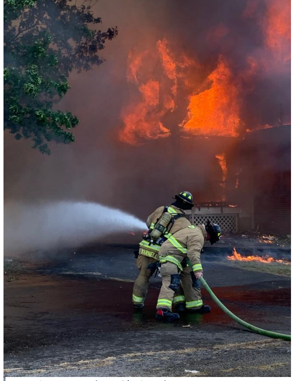
Preparing to attack