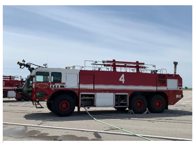
LCK Tri-Annual Drill