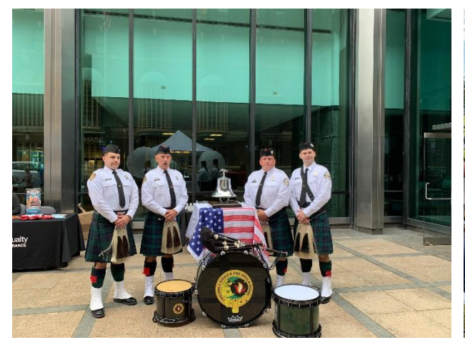
Columbus Police & Fire Drum Corps.