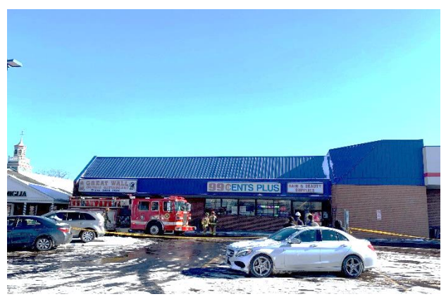
Great Wall Chinse Rest.

Those last few days of the month saw a lot of activity. In addition to the two days of ice rescue training, we made a 25-mile run into eastern Delaware County for a house fire. We used our kerosene heater to thaw out an extension ladder so it could be placed back in service. This was followed by a house fire in the south end of Columbus when the wind chill reached a balmy (negative) 17 degrees. Then, just after midnight, Rehab 1 was called out to Pickerington for another house fire and we spent the morning of