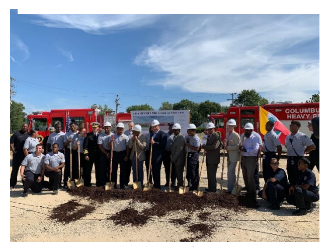
CFD Station 16 Groundbreaking