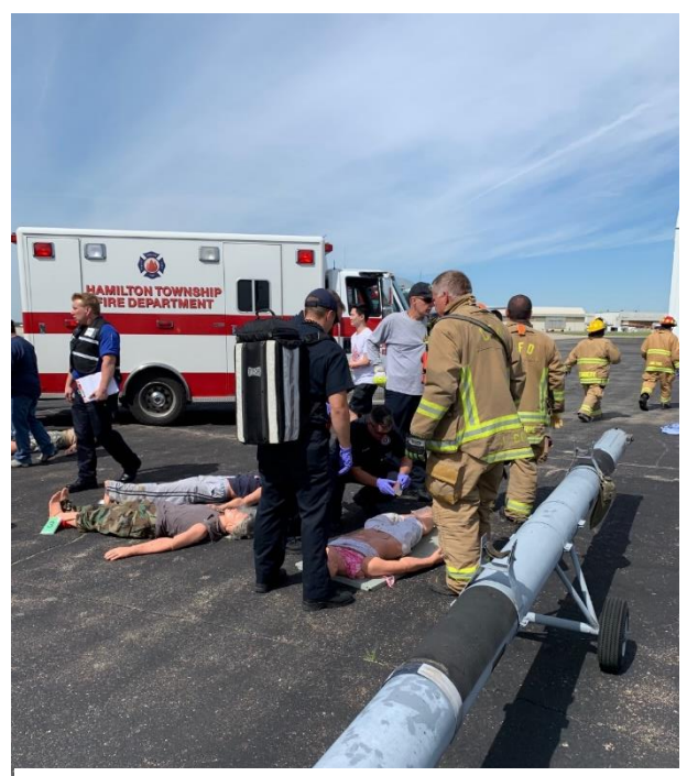
LCK Tri-Annual Disaster Drill

counties. Always a good time and an opportunity to share lessons learned. On June 28, in addition to staffing for hot weather responses, we worked with Columbus recruit class #109 for Saving Our Own training at the old Mt. Carmel (Franklinton) hospital, which was soon to be demolished.