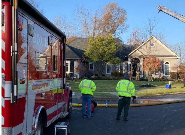
2 Alarm in Baltimore