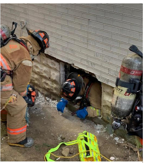
Saving Our Own training