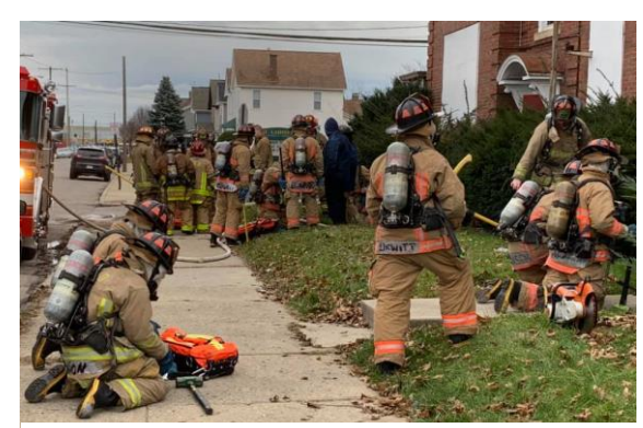
Saving Our Own Training