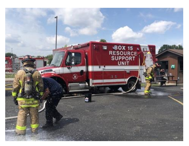
Decon at OFA