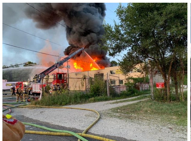
MillTech 3rd Alarm