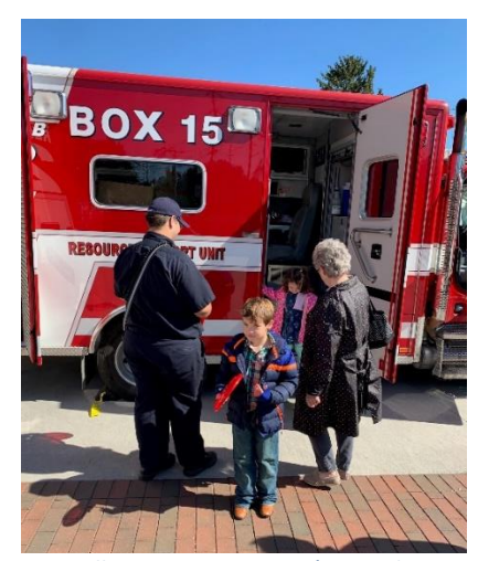
Westerville Open House