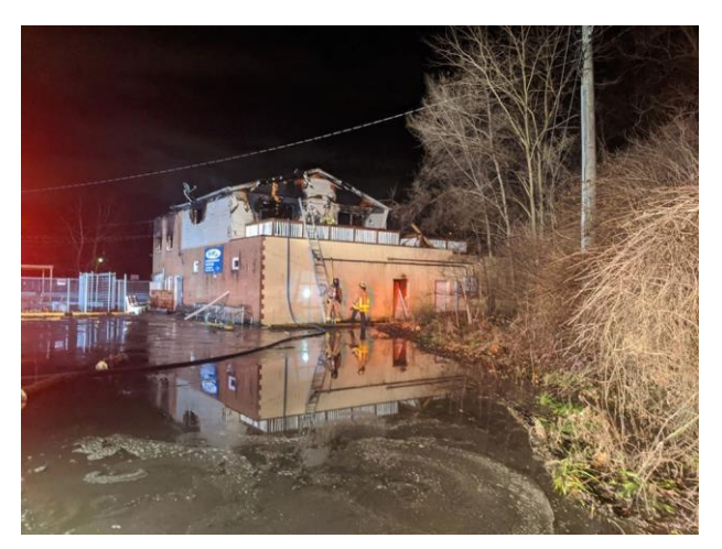
Valleyview Swim Club fire