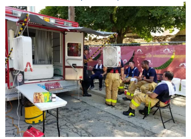
Saving Our Own at Mt. Carmel