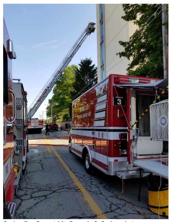
Saving Our Own at Mt. Carmel

I hope you will take the time to look over our statistics, the numbers which reflect the volume of products we dispensed. We are very fortunate to have generous businesses and personal donations that provide us with water, sports drinks, and equipment. The financial donations help us with the cost of other supplies and maintenance of our trucks. We continue to add equipment to our trucks that can be used during the extreme weather conditions we have been seeing more of.