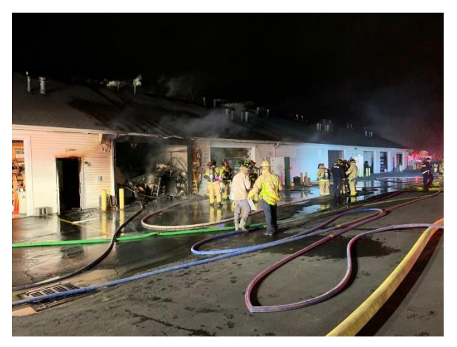
Station St. fire