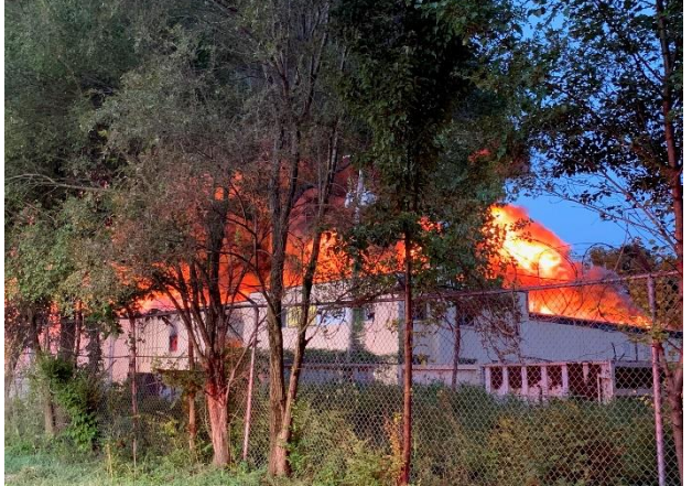
MillTech 3rd Alarm