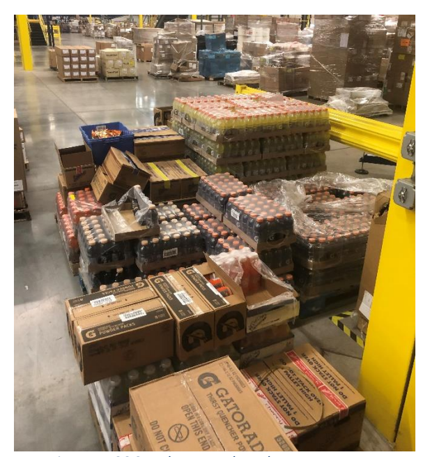
Donation at MSC Supply