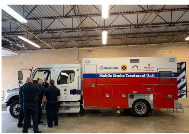
Strokemobile training