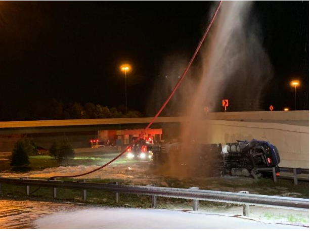
Overturned Tanker