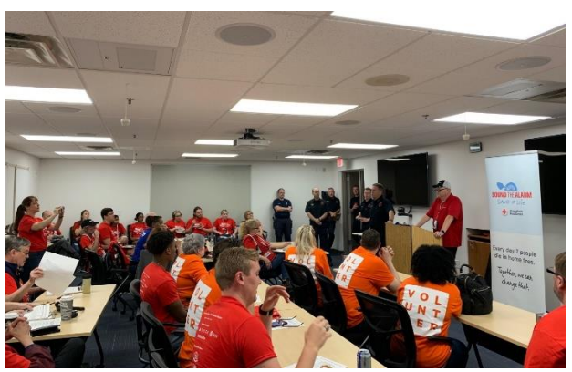
Smoke Alarm orientation