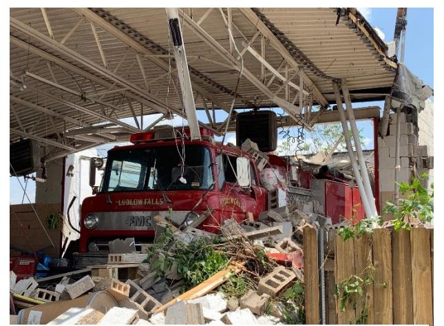
Tornado Damage