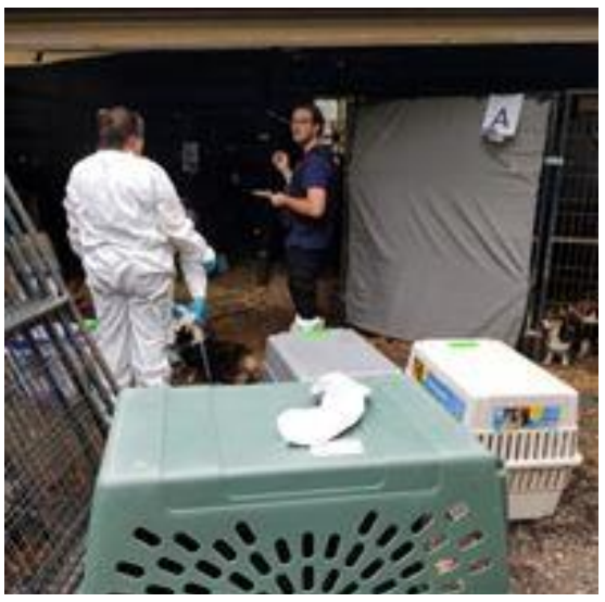
Animal Rescue mission