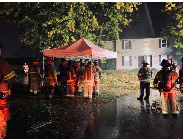
Excaliber Place fire