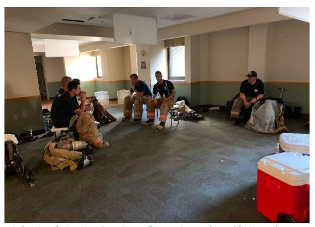
High-Rise & Saving Our Own @ Mt. Carmel - J. O'Brien photo