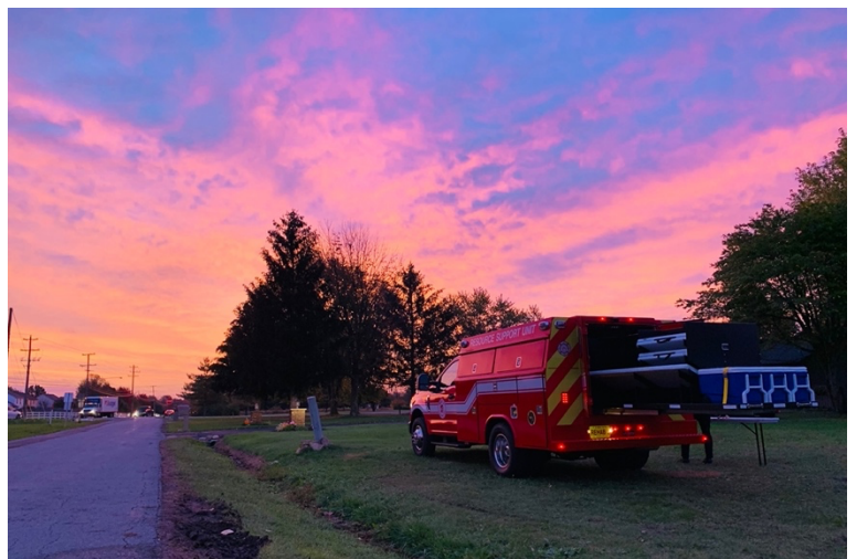
Jackson Township Live Burns