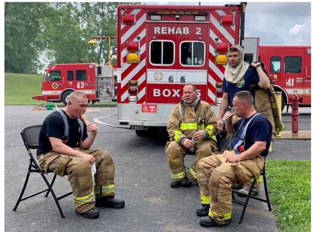
Ohio Fire Academy Live Burn Exercises