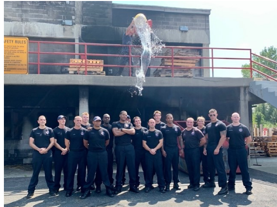
Clockwise from Bottom Left: Live burns exercises at the Ohio Fire Academy, Upper Arlington Working Fire, Recruit Training Burns, Madison Township Training Event, and Violet Township Working Fire