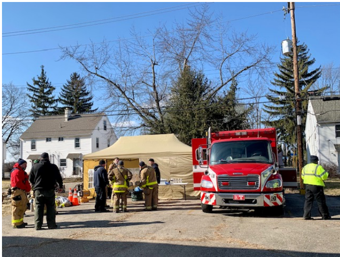
Saving Our Own Training