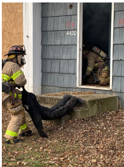
Columbus Live Burns