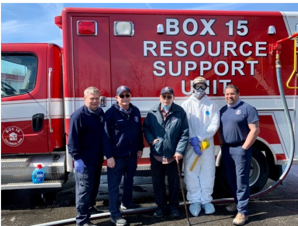
Upper Left: Marion Road Fire Middle: MSC Supply Pickup Bottom Left: Ohio Fire Academy