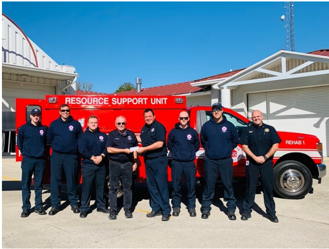
Genoa Township Donation