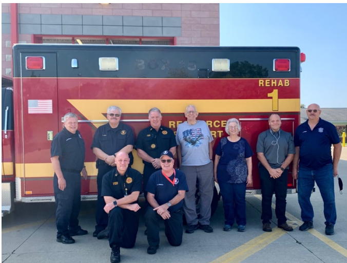
Seneca County Receiving the Old Rehab 1