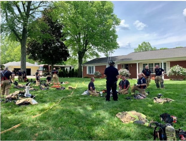
Worthington Working Fire – 86-degree heat index.