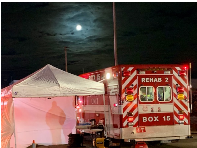
Markison Ave, 2 nd Alarm