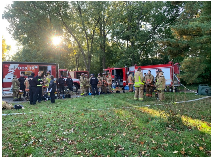
Saving Our Own