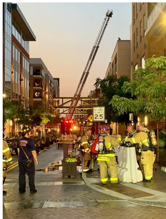
July Business Meeting and a 2 Alarm Blaze in Dublin