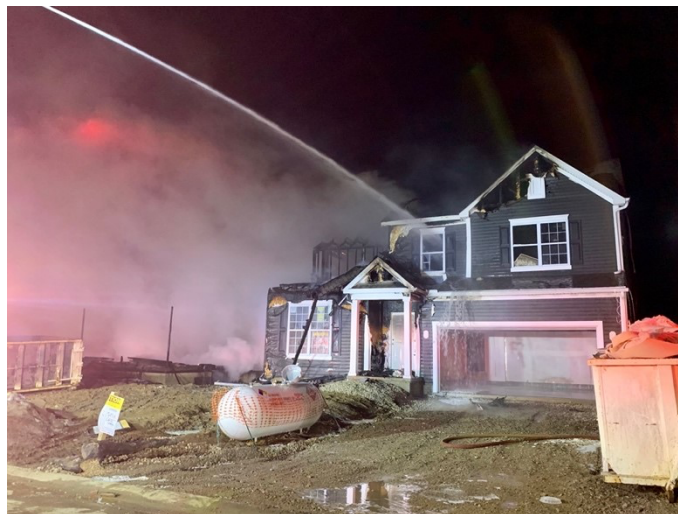
Coral Creek Drive