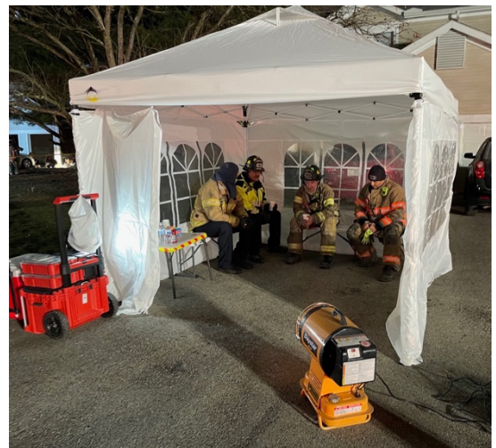
East Fulton(L) Anne Ct, Truro Township (Right)