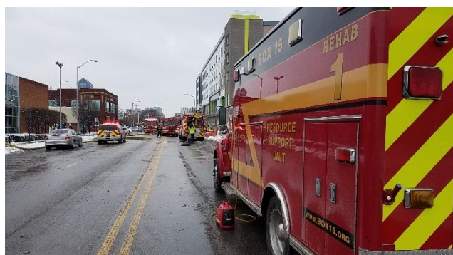
E. Main Street 2-alarm fire

house fire in Urbancrest. The cold weather moved in for the end of the month, though, resulting in four cold weather standby nights throughout the final week of December.