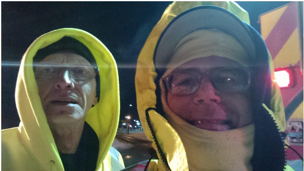
Karl Road working fire