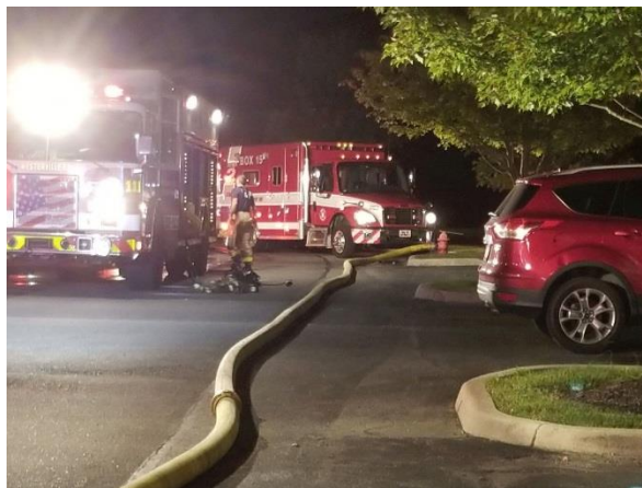
Polaris Lakes Drive 2-alarm fire