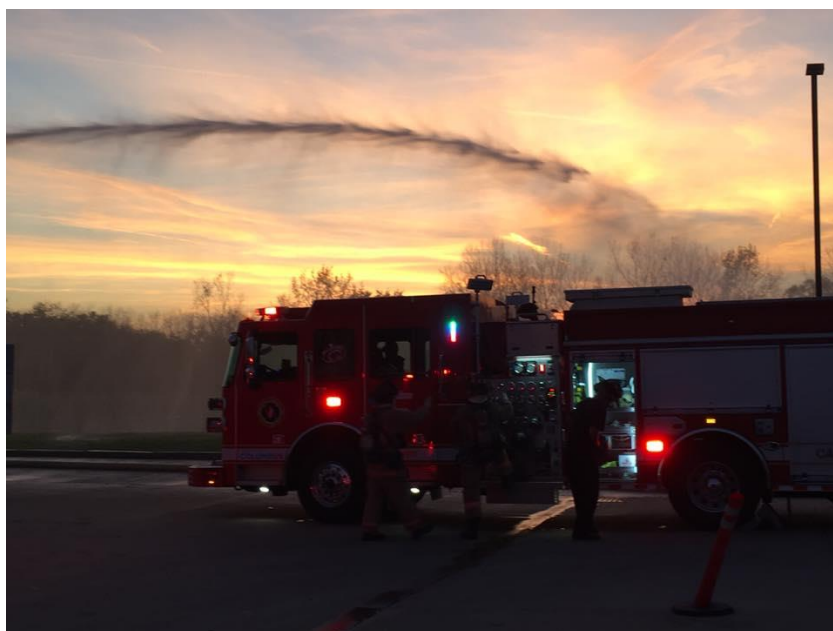
Night operations training