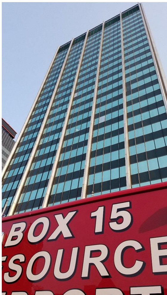
9/11 Memorial Stair Climb