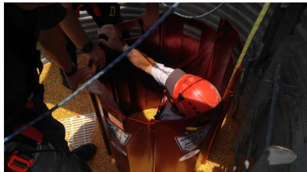
Grain bin rescue – Photo by J.Penty

In June, we responded to one working fire during a hot weather standby (heat index over 100°F). We also provided rehab and support services for four training events, including the unique grain bin rescue class. The month came to a close with the Central Ohio Antique Fire Apparatus Association's annual Muster.