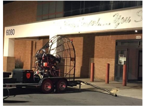
E Main Street 2-alarm fire