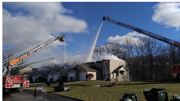
Buffalo Run 2-alarm fire

The year got off to a quick with two greater-alarm fires on January 2 nd . The first was an early morning 2-alarm apartment fire on the far southeast side. Late that evening, we responded to a 3-alarm fire at a thrift store warehouse. Crews remained on scene until daybreak. On the 4 th , a crew responded to a 2-alarm apartment fire on the far northeast side. The cause of the fire was determined to