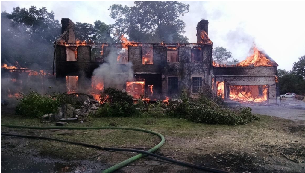
N Wilson Road training fire