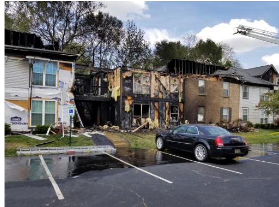
Lands End Circle 2-alarm fire