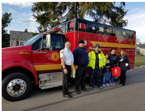
Linden area smoke detector outreach (December)