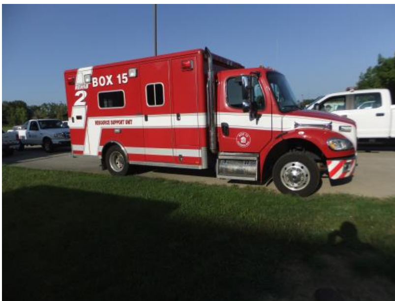
New Rehab 2 – Photo by J.O'Brien

The summer brought with it the excitement of a new addition to Box 15's fleet. As discussions continued about possibly replacing Rehab 2, the club began exploring options for obtaining a new truck. Those options were quickly numbered down when Plain Township decided to generously donate one of their medic units they had replaced. Not only was the price perfect, but the new truck is nearly identical in layout to our other two rehab units, allowing members to know exactly where supplies would be regardless of which truck they were in. So over the course of the summer, the new truck was made ready for service and the old truck taken out of service.