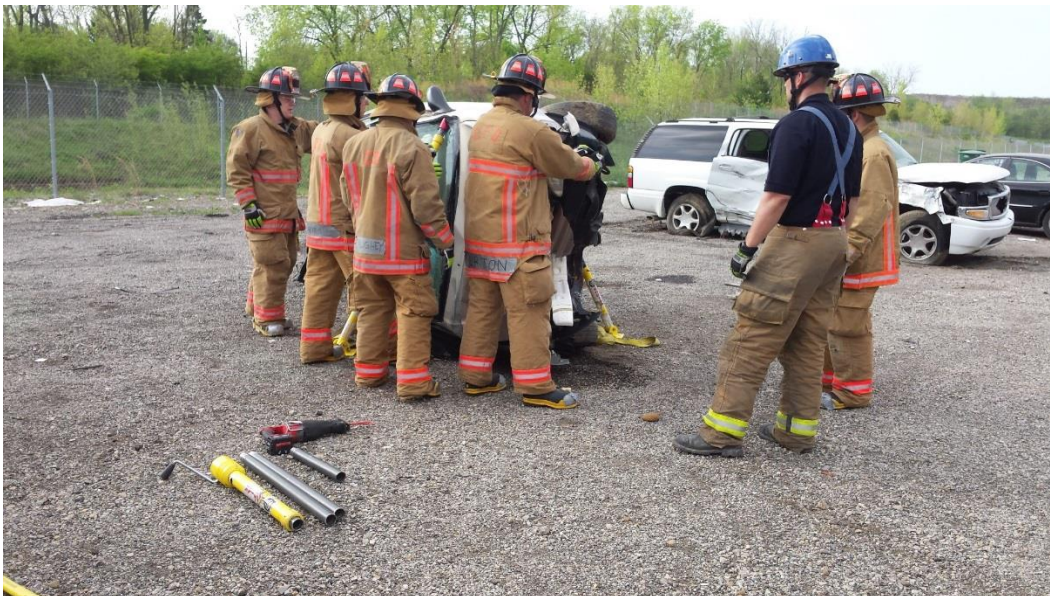
Auto extrication training