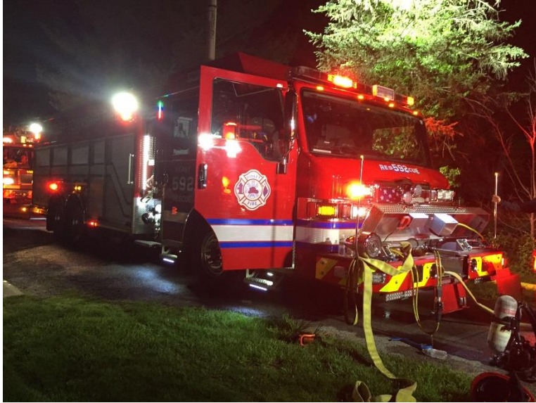
Walnut Street NW working fire