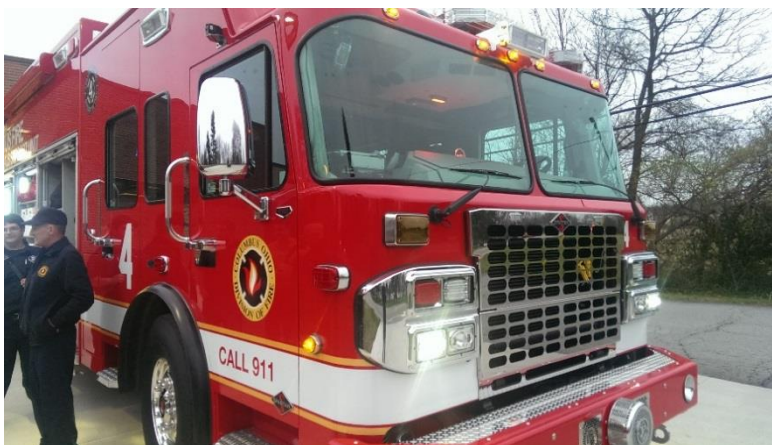
New Columbus Fire Hazmat Truck

retirement dinner in April for everything he's done. Congratulations on your retirement, Chief!