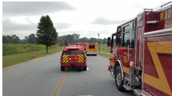
Pickerington Labor Day Parade – Photo by T.Knowles