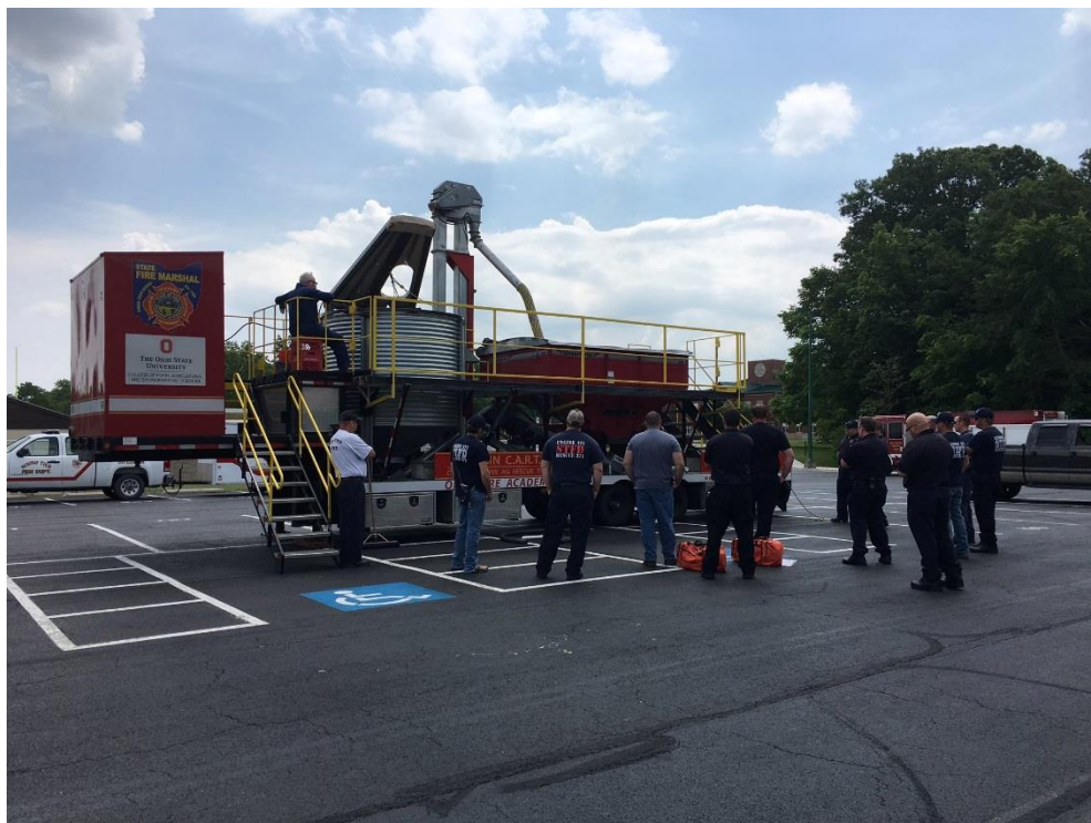
Grain bin rescue training – Photo by J.O'Brien