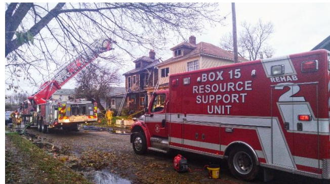
N. Guilford Avenue 2-alarm fire