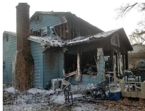
Ashley Avenue working fire

outreach event. Mid-month brought three fire responses – one an extra-company working fire at a west side warehouse, followed by a residential working fire in Whitehall, then a 2-alarm