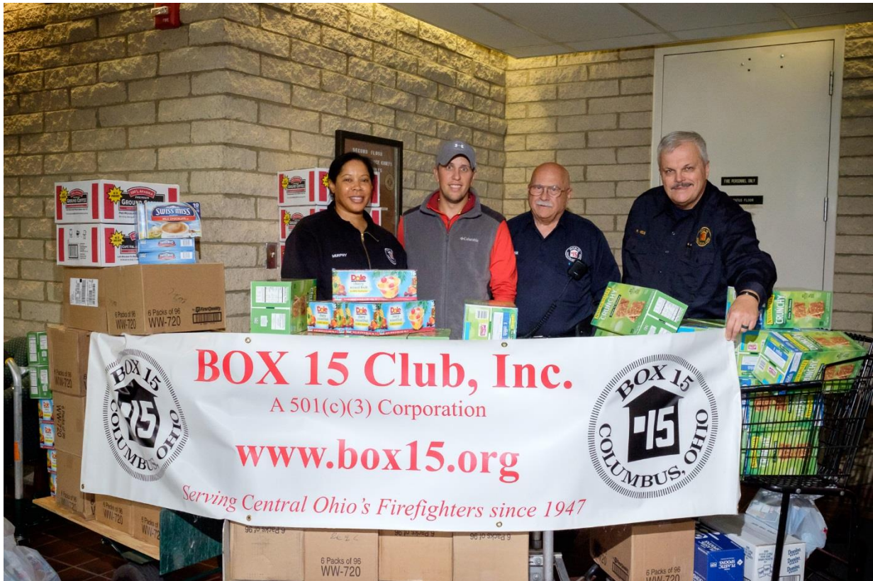
Foresters Financial donation – Photo by S.Lewis