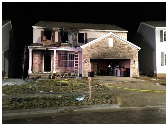
Faulkner Drive working fire

February provided some relief with only two responses. One was a house fire in Fairfield County, the other was a 2-alarm apartment fire on the far northeast side.