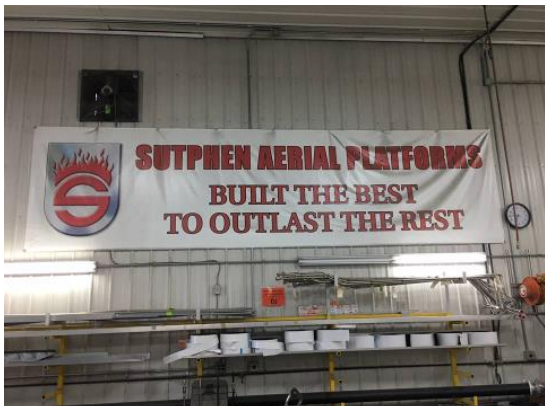
Sutphen tour