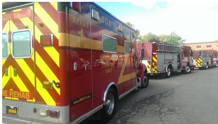
Linden area smoke detector outreach (May)