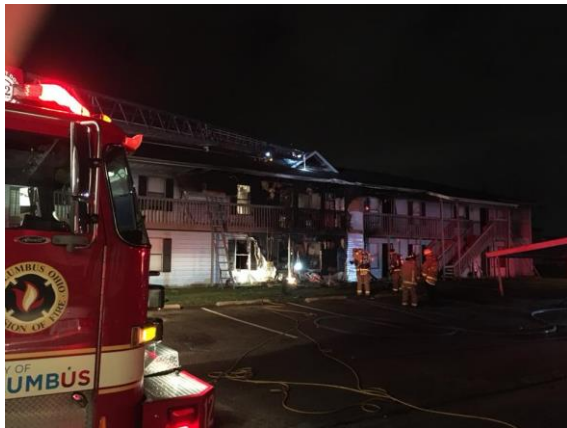
Derrer Height Lane 3-alarm fire

Activity remained consistent through November, with Box 15 responding to several fires. The month started with a working fire at an east side tire shop. The remainder of the month's fire responses were for multi-alarm fires. The first was a 3-alarm in a 2-story apartment building on the city's west side. The second was a 2-story duplex with extension to a neighboring duplex, resulting in a 2 nd alarm dispatch. The final fire run was a 2-alarm fire in a high-rise apartment building. Box 15 also provided support at two training exercises and to volunteers working Columbus's Veterans Day Parade.