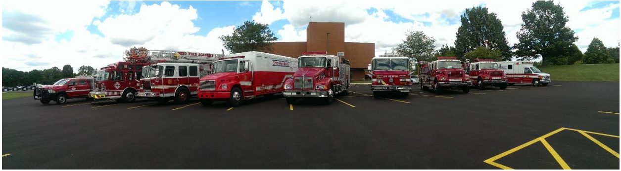
COAFAA muster