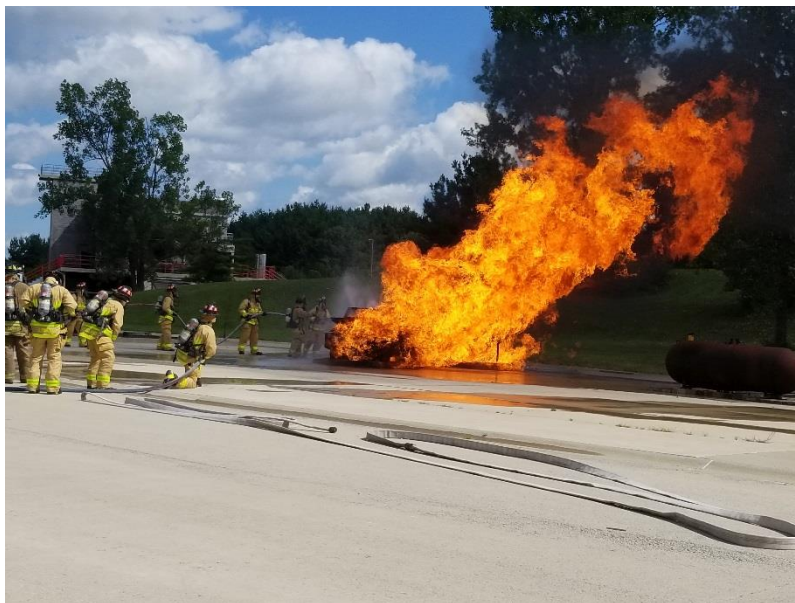
Auto fire training (August)