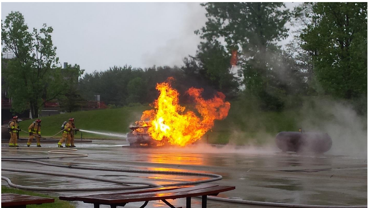
Auto fire training (May)