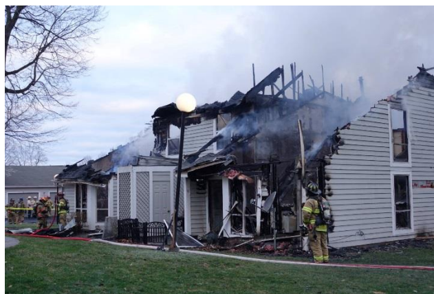
Foxhound Lane 2-alarm fire