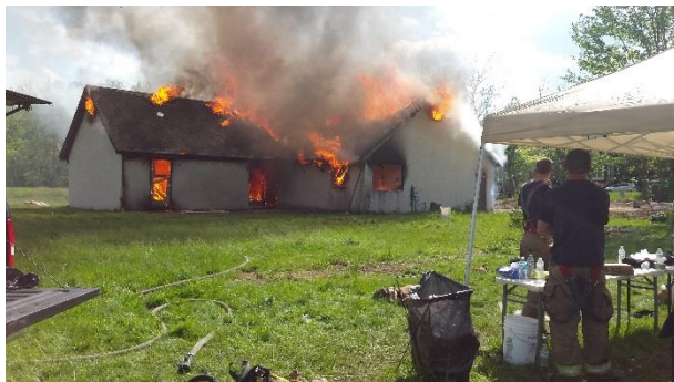
Training fire – Photo by B.Hess