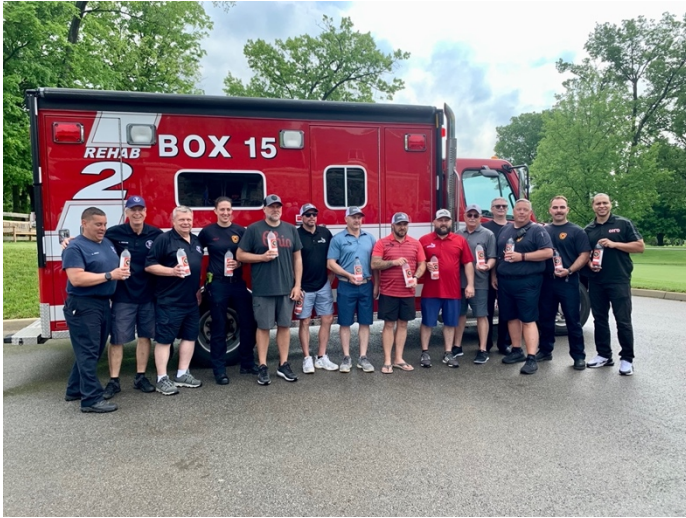
OH2O and Berlin Printing