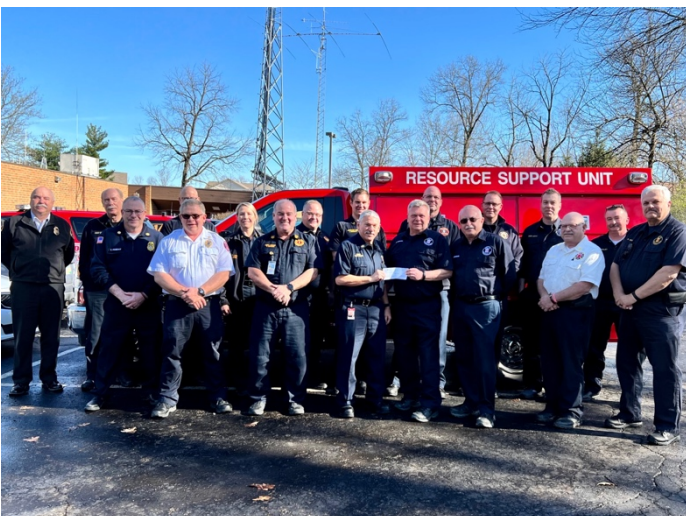
Franklin County Fire Chiefs