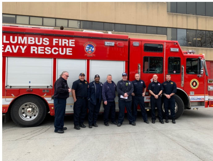
Columbus Firefighters Foundation