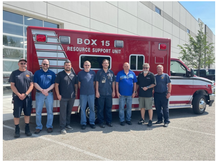
Horton Emergency Vehicles

And to all those not mentioned, we sincerely appreciate your support!